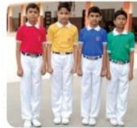
House Dress and Track Suit on Saturdays